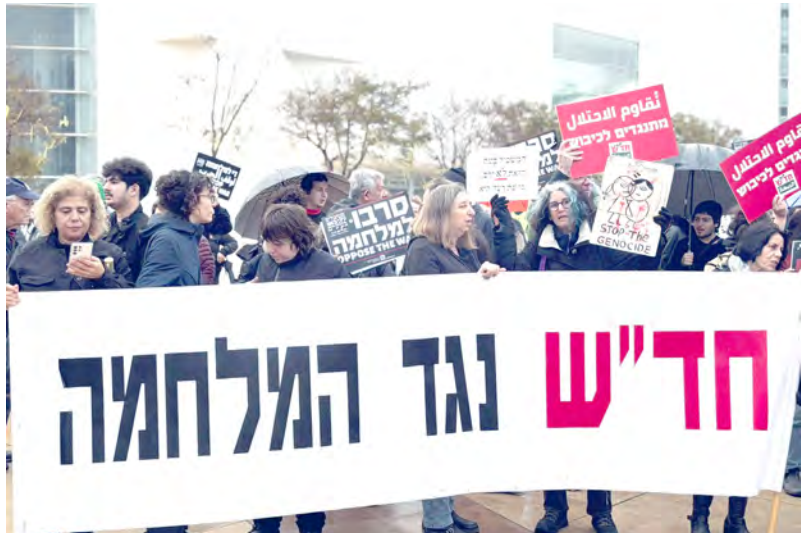
Anti-war and anti-occupation protest in Tel Aviv

Imperialism in the Global South is not only direct. Look at Congo, Sudan, and across Africa – as mechanisms to gain access to natural resources. The same applies to Latin America -- Venezuela and Cuba. This is about imperialism seeking global dominance while repressing resistance by people, by sovereign nations. You cannot understand the attack on Iran and the resulting oil shortage without understanding what happened in Venezuela. The US sought to secure oil supply -- others may face shortages, but not the United States. You cannot ignore the blockade of Cuba or the siege of Gaza for twenty years before October 7, 2023. These fundamental processes of imperialism -- the subjugation of peoples, the subjugation of nations -- are interconnected. They come from the same logic: control of natural resources, subjugation of peoples, and denial of self-determination -- of Palestinians, Iranians, Cubans, Venezuelans. For us, this is all connected. When we protest the war on Iran, we also carry the Cuban flag -- because it is the same system of aggression.