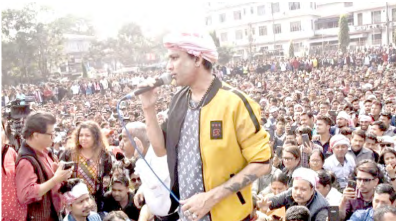
Zubeen Garg taking part in anti CAA rally at Latasil playground in 2019, singing, "Politics nokoriba Bandhu".

Z ubeen Garg was neither a statesman nor a hero who broke down the old society to build a new one. Yet, his death sparked a mass outpouring of grief and protest.